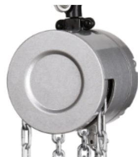
light weight aluminum shell